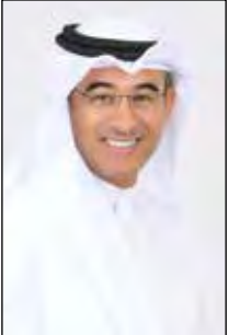
H.E. Mohamed Ali Rashid Alabbar

Director (resigned as of 9 February 2016)